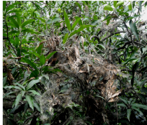
Mango Leaf webber Infested shoots