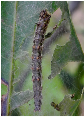
Mango Leaf Webber